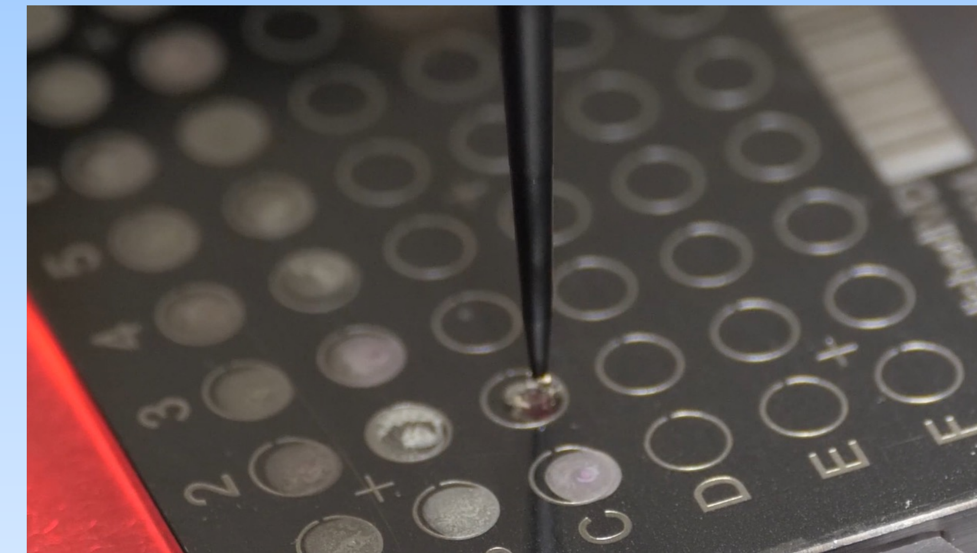
Figure 2. Automated addition of matrix